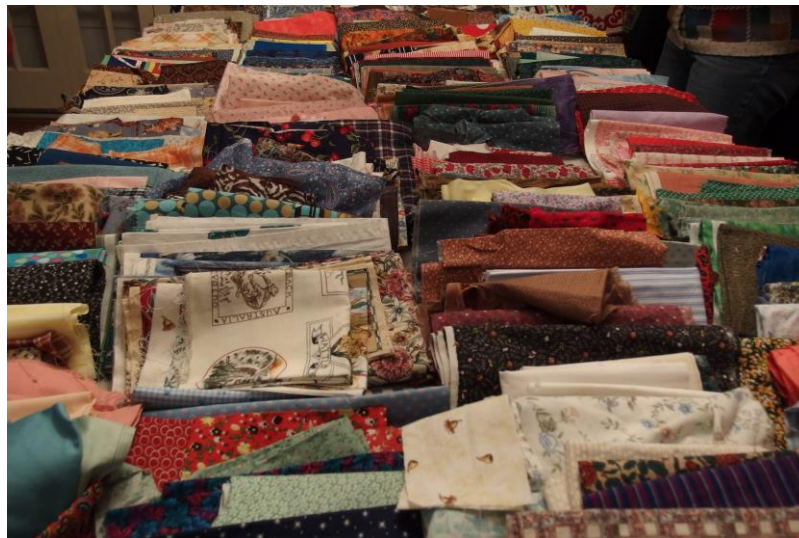
Above: 2015 Fabric Swap

But make sure no scrap is left behind – anything that doesn't go to a new home will go to Charity Sharity.