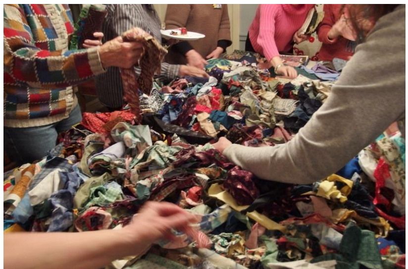
Right: 2015 Scrap Heap