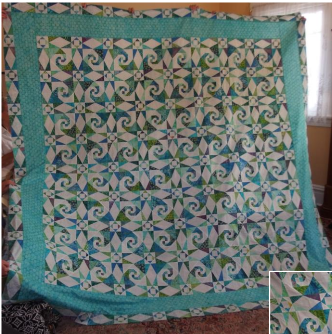
Above & right: Mary Carr's batik beauty, a combination of Storm at Sea and Snail's Trail blocks