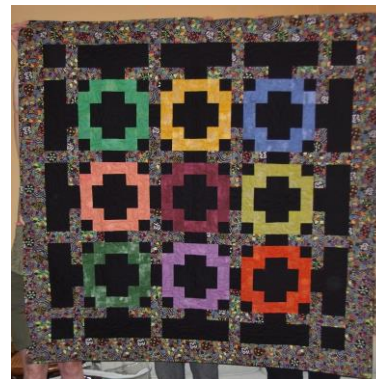
Left: Jan O's PAussietivity, a remake from Cut & Shuffle Quilts featuring Australian fabric. Jan will be teaching Cut & Shuffle blocks at the Quilted Fox on Nov. 5.