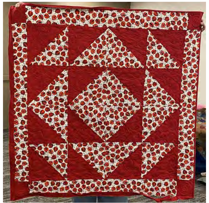
Gwen Clopton for Operation Shower