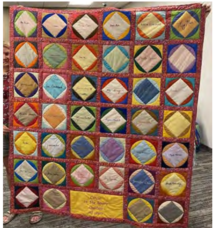
Third Place - Other Quilted Item category Betsy Sweeney