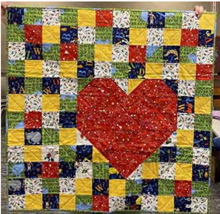
For Operation Shower by Carolyn Stoll