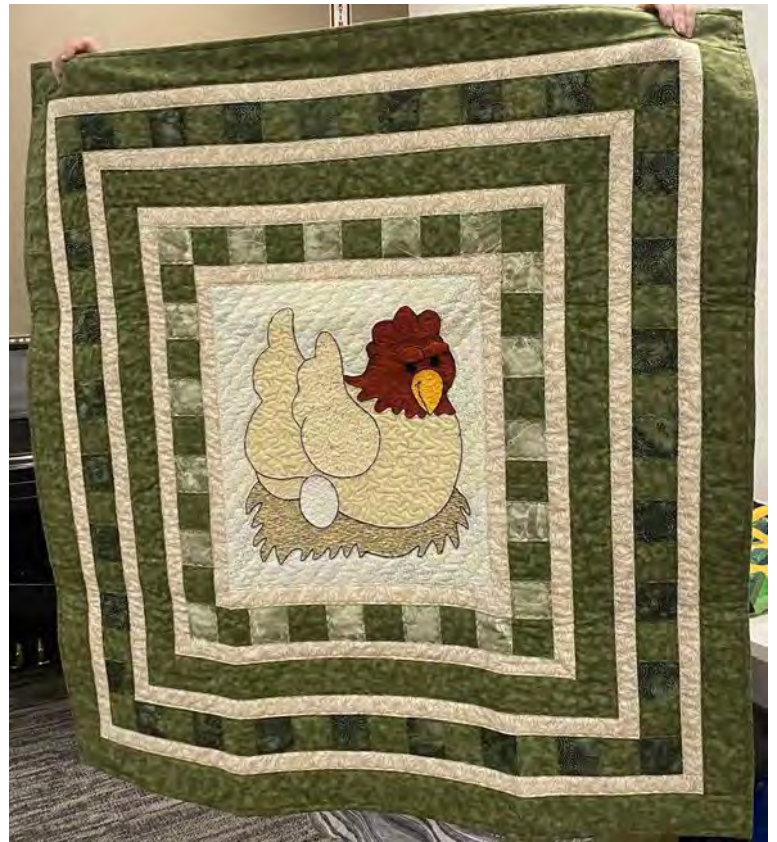
Suzanne Marshall for Operation Shower