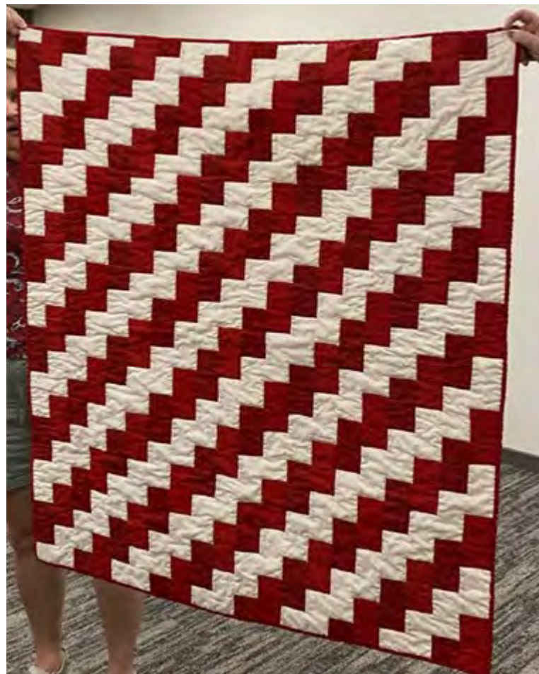
For Operation Shower