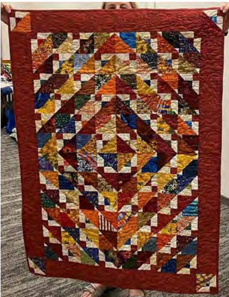
For Operation Shower by Carol Peck