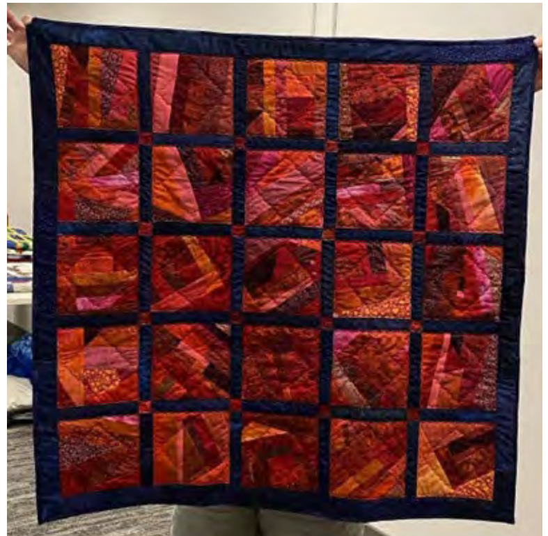
Second Place - Operation Shower category Suzanne Marshall