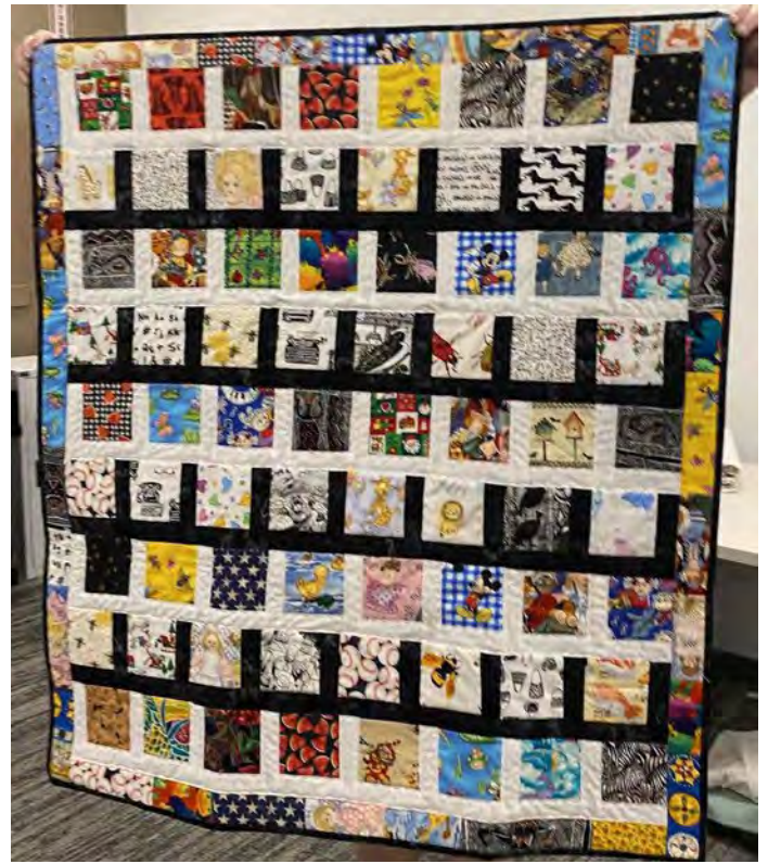
Suzanne Marshall for Operation Shower