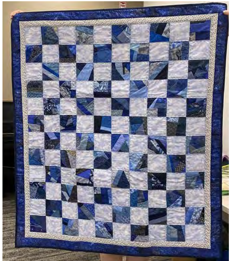
Suzanne Marshall for Operation Shower