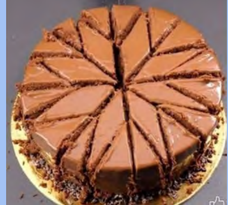
How quilters cut cake