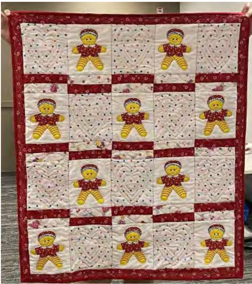
Third Place - Operation Shower category Vivienne Mazzotta