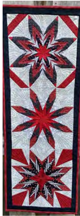
First Place - Other Quilted Item category Laura Falk