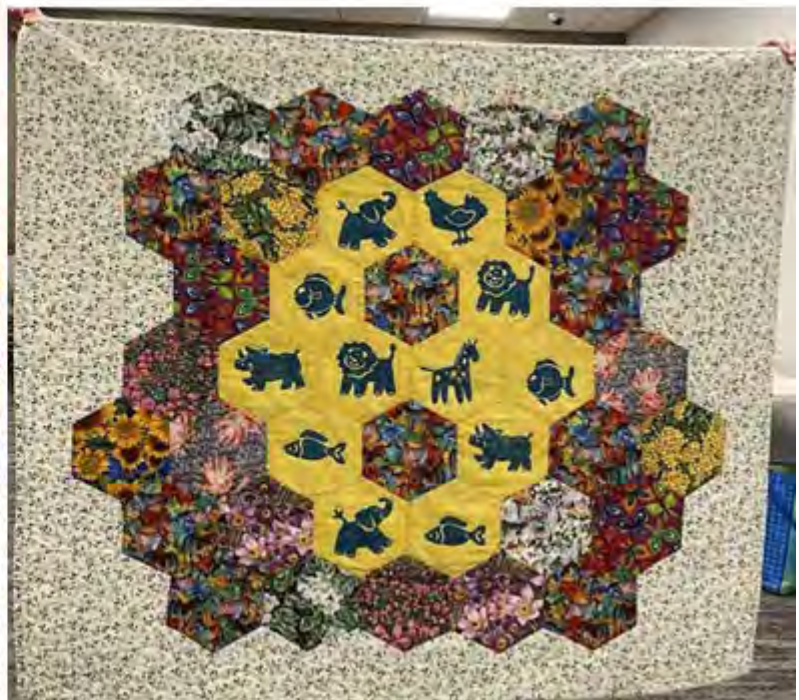
For Operation Shower by Pat Owoc