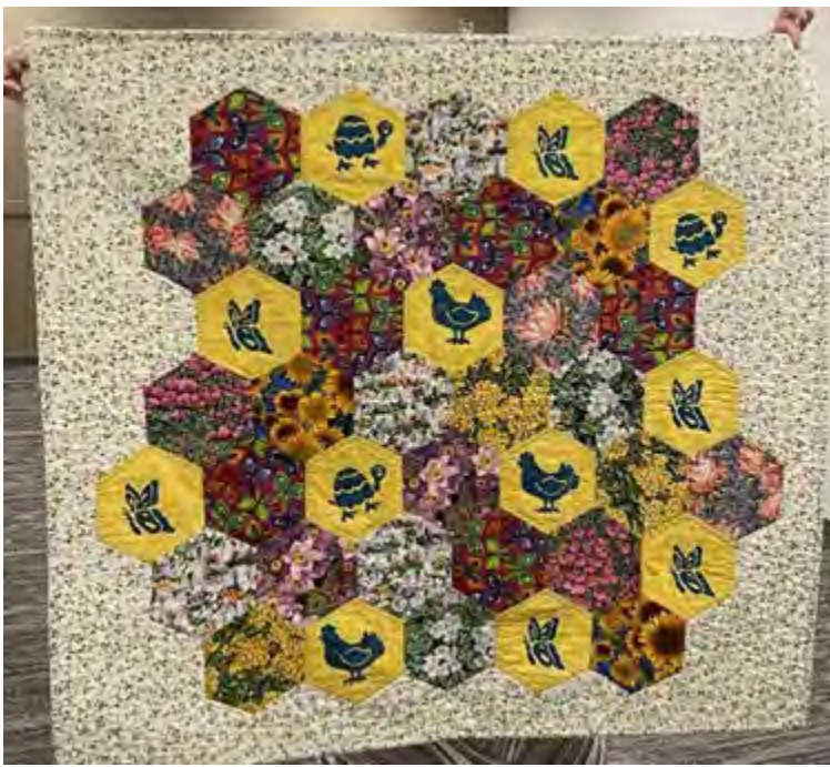
For Operation Shower by Pat Owoc