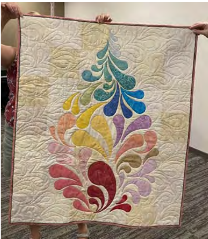
First Place - Operation Shower category Lou Kaufman