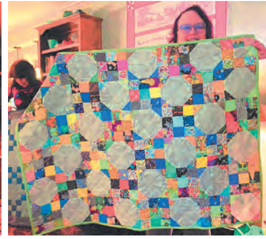
Donna Fox for Operation Shower