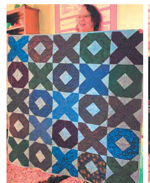
Donna Fox for Operation Shower