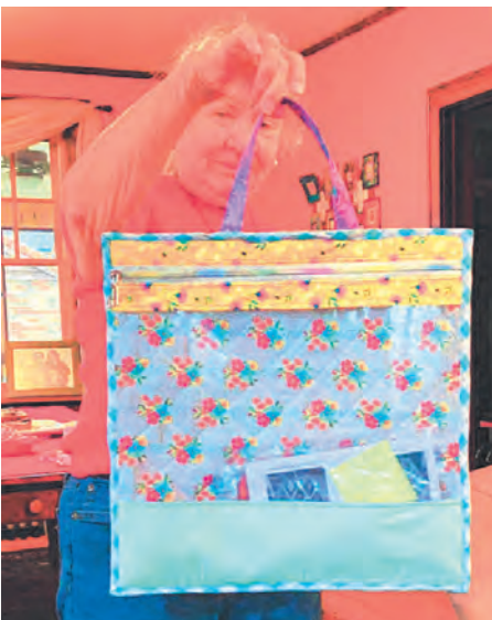
Two projects by Norma Silk