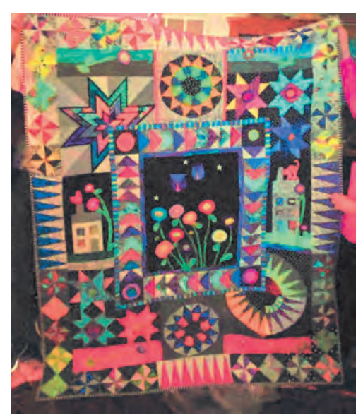
Peggy Harris - Quilted Fox Block of the Month